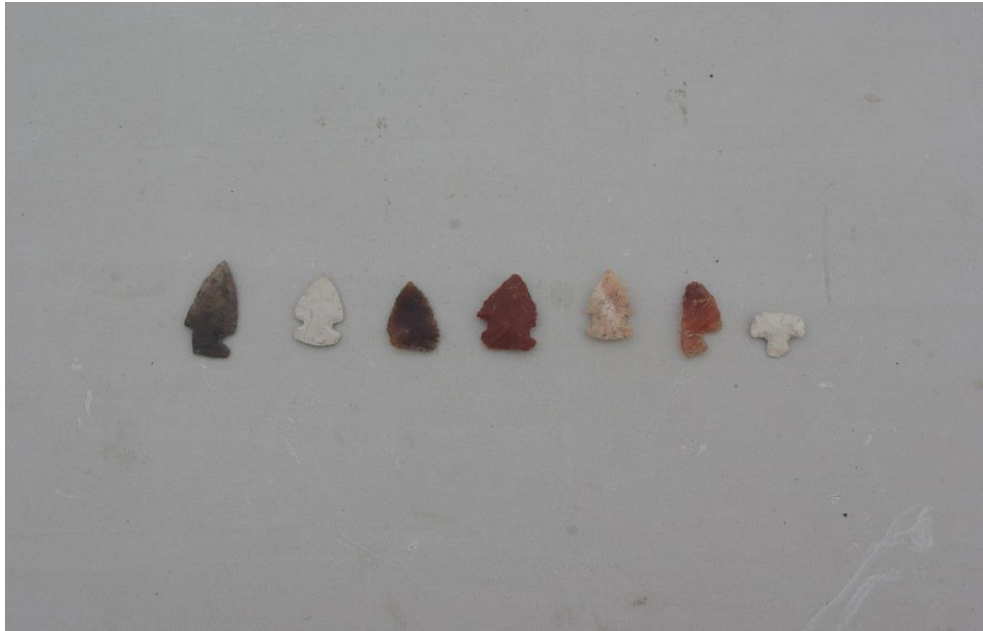
Assortment of stone projectile points made of a variety of raw materials sourced from specific areas in the wider Northeastern Plains, and one small stone tool with an unidentified use (far right).

Included among the stone artifacts are projectile points of the well-known Plains Side-notched and Prairie Side-notched types. Most of them are made of local cherts, but several are made of Knife River Flint from North Dakota, and a few were fashioned from Denbeigh Point Chert that is from a specific area at the north end of Lake Winnipegosis. Also present are scrapers, bifaces, knives, drills, grinding stones, whetstones (sharpening stones), adzes, paint palettes, chithos, and much more. A small hand-held sandstone whetstone (shaper) was recovered. The only other known example (not from The Forks) is in the collections of The Manitoba Museum.