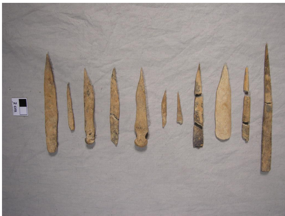
Eleven awls recovered from Cultural Level 1 along with 16 other bone tools.