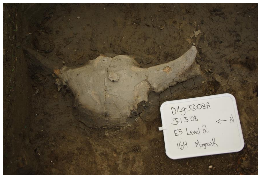
Several bison skulls were recovered during the course of monitoring the excavations.

A half dozen of these hearths had an un-charred bison skull, facing south, quite deliberately placed upside down on them. This is only the second time that this has been seen by local archaeologists (the first not being at The Forks).