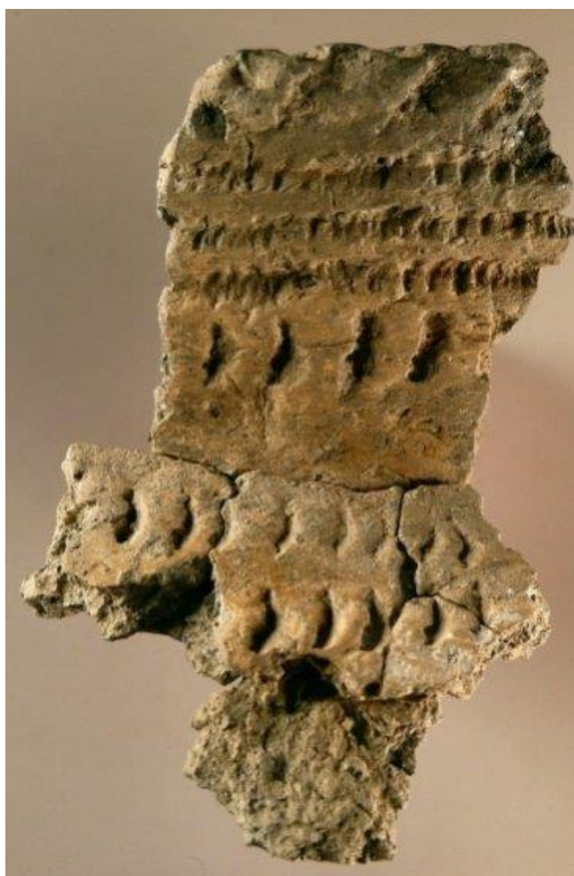
Identified as Level 1 - Holly Oblique – Rainy River Composite – one of a few new types assigned to sherds found at the CMHR site interpreted as ‘homegrown’ to The Forks.

Many different styles of pottery have been recovered from previous digs at The Forks. This diversity in pottery styles, decoration and form, is one of the reasons archaeologists know that several First Nations occupied The Forks. The pottery from beneath the CMHR however, is almost all Rainy River Composite, quite uniformly compared to what has been found elsewhere at The Forks and nearby Shaw Park for about the same time period. The exception is a small occupation of a later cultural group (Selkirk) that was identified at a higher elevation. This leads one to believe that the CMHR site was a preferred campsite for one particular large group, known as Rainy River people by archaeologists, with other groups at nearby campsites, coexisting.