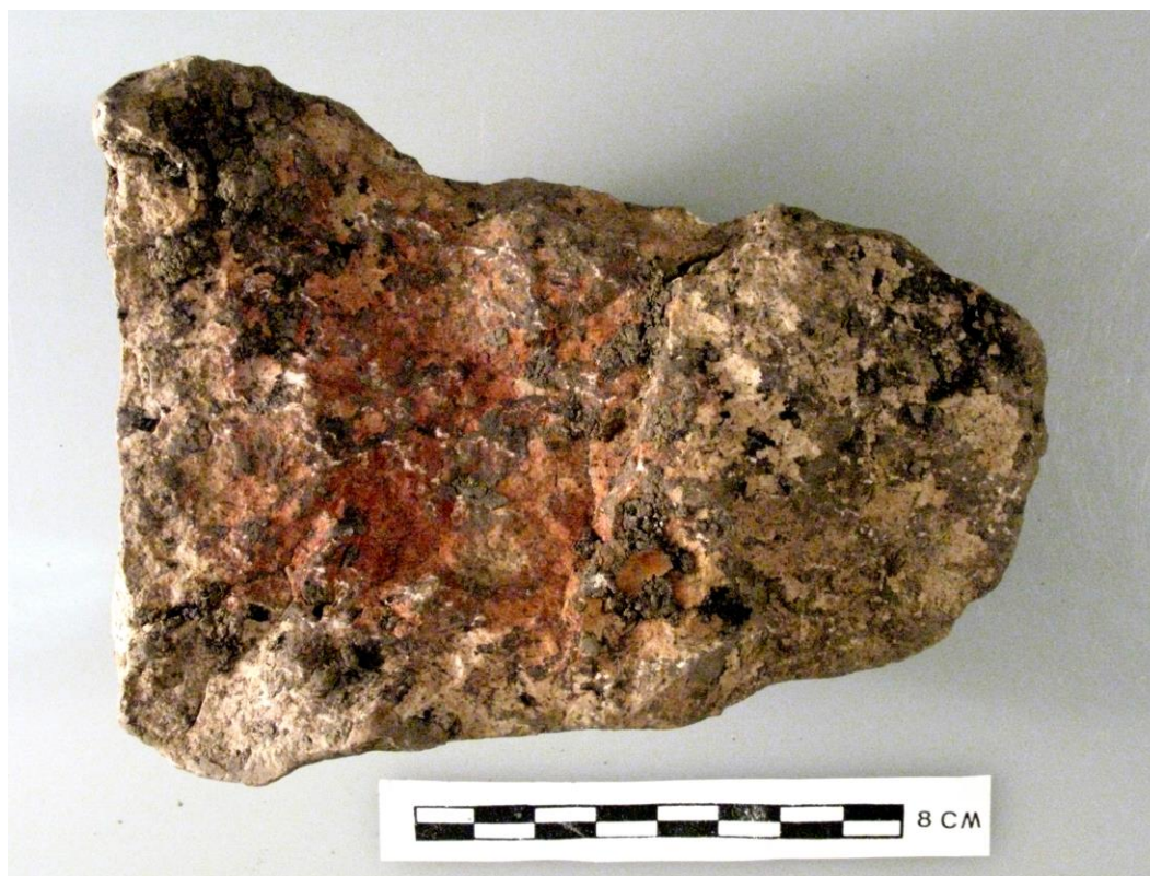
Natural stone “bowl” opportunistically used to mix paint with ochre and beeweed.

Some people interpret the presence of red ochre as evidence that there were human burials, however I wish to emphasize that there was no evidence that the CMHR site has ever been a human burial site and that red ochre was and continues to be used in a variety of ceremonial uses. No human remains were found.