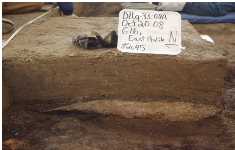
Cross-section of a hearth – Phase 1, 2008.

A startling number of hearths (or campfire pits), 191 in total, is quite possibly the largest concentration of hearths ever uncovered in Canada in such a small area. It means that the CMHR site was a significant living and working area, suggesting regular habitation in seasonal rounds over generations.