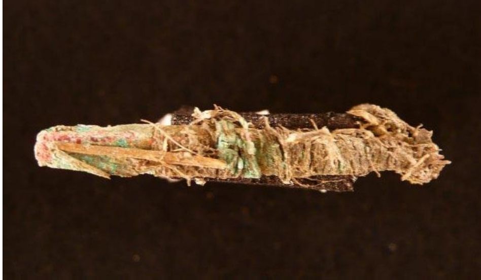
Copper artifact - Tapered linear tool that probably functioned as an awl, flattened tip, 36.8 mm in length, 3.9 mm in width, 2.4 mm thick. Under 10x magnification, it appears to have been hammered rather than ground into shape at the tip.

Two human footprints and one hoof print were also uncovered. These are not the first prints to be found at The Forks, but the human footprints are the first from an entirely Indigenous (i.e., pre-European) context. One of the CMHR site examples is clear; it is thought to be that of a male wearing moccasins heading in a southwesterly direction and is approximately 750 to 800 years old. The hoof print was heading in a north-easterly direction. A bronze cast of one of the human footprints is on display in the Museum.