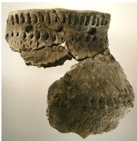
Reconstructed portion of Vessel 42 from Level 1. This vessel could be interpreted as an early expression that would eventually develop into Bird Lake or Duck Bay or both. It fits neither, but there are traits suggestive of both.

filtered through the cultural influences of the plains/parkland further to the south and west of the Lake of the Woods, rather than through the boreal forest and its southern margin, as is the case for the Winnipeg River drainage materials. In their decoration and form the materials of both geographic regions display their original developments from the coalescence of Blackduck and Laurel ceramics. Although the ceramics of these two regions share many similarities, those from