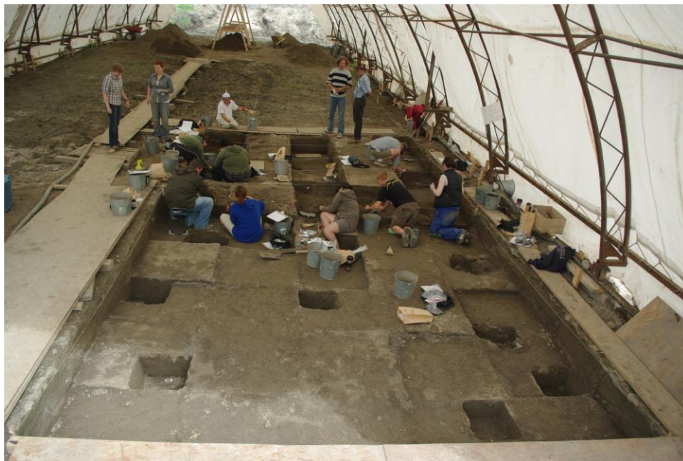
QCL archaeological crew excavating Root A under tent with dry screening area at rear, spring 2008.

remains, thousands of human-made and human impacted artifacts were found beneath the entire footprint of the museum.