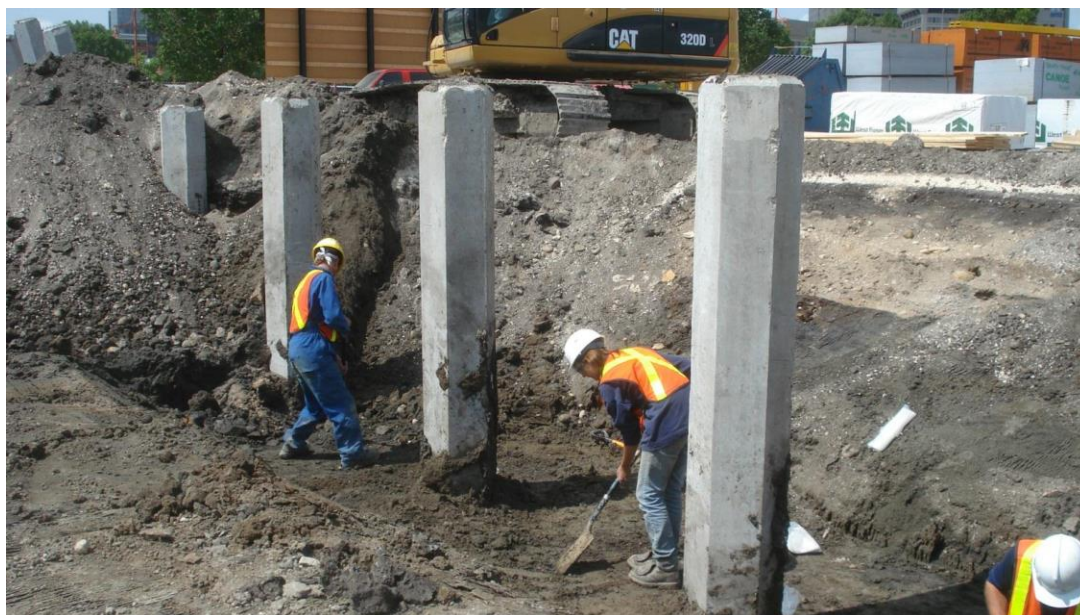
Stantec Consulting Ltd salvaging bison kill layer in northwest corner of Root A at 228.222m ASL, 2009.