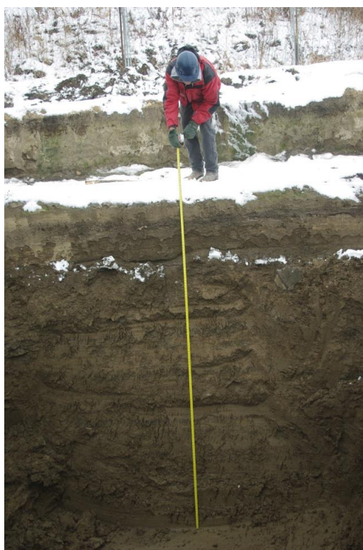
This wall profile shows an annotated stratigraphic wall from an exploratory mechanical excavation at the eastern edge of the Phase 1 dig site. This mechanical excavation was undertaken as a requirement of the Heritage Permit as per the Environmental Impact Assessment. Note that the cultural layers go well beyond the deepest levels excavated at the CMHR Site and remain in place (in situ) under the museum in Root A.