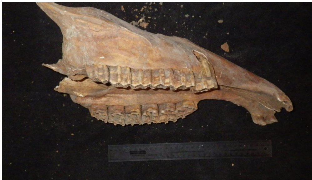
Horse mandible – Complete horse skeleton of a young mare was found with foetus bones. Thought to be related to the HBC Experimental Farm at The Forks post-1820 to pre-1880.